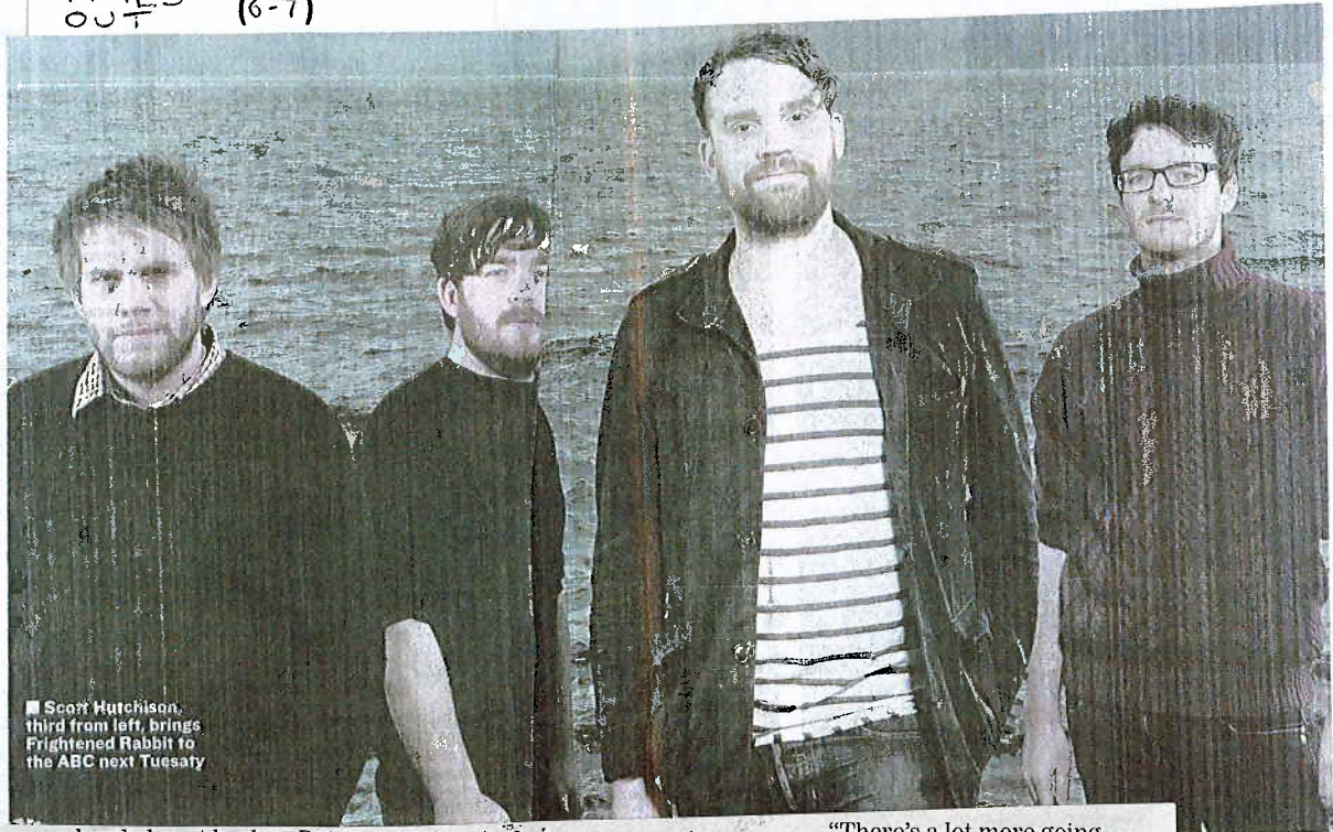
■ Scott Hutchison, third from left, brings Frightened Rabbit to the ABC next Tuesday

record and almost lay low. But it's all kept growing, which has been a surprise for us.